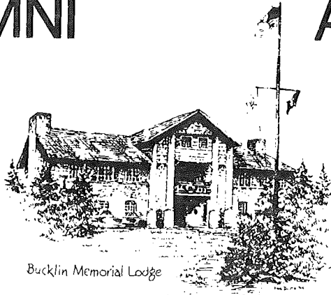
Bucklin Memorial Lodge